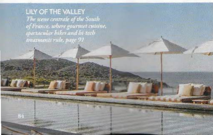
LILY OF THE VALLEY The scene centrale of the South of France, where gourmet cuisine, spectacular hikes and hi-tech treatments rule, page 91