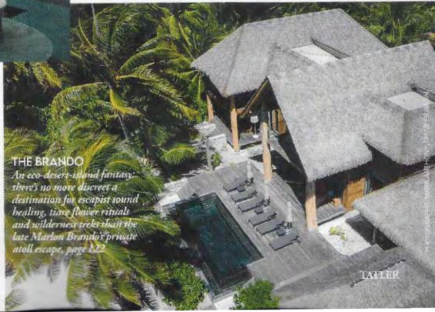
THE BRANDO An eco-desert-island fantasy, there's no more discreet a destination for escapist sound healing, trace shower rituals and wilderness treks than the late Marlon Brando's private atoll escape, page 122