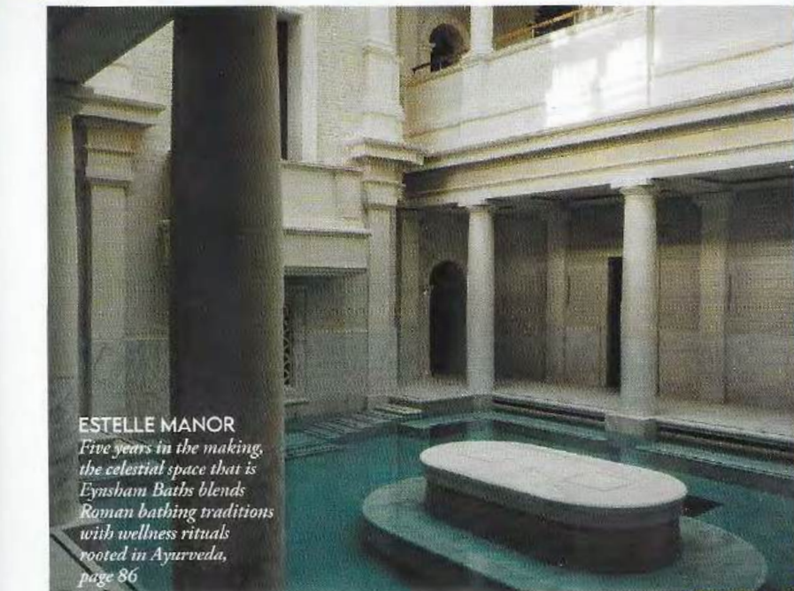
ESTELLE MANOR Five years in the making, the celestial space that is Eynsham Baths blends Roman bathing traditions with wellness rituals rooted in Ayurveda, page 86