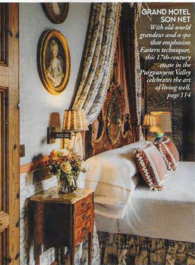
GRAND HOTEL SON NET With old-world grandeur and a spa that emphasises Eastern techniques, this 17th-century estate in the Puiggnonyent Valley celebrates the art of living well, page 114